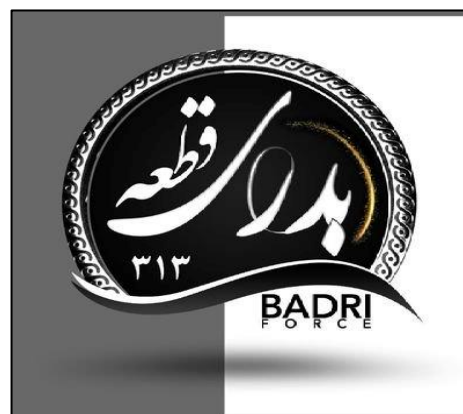
Figure 3: second official logo of Badri 313