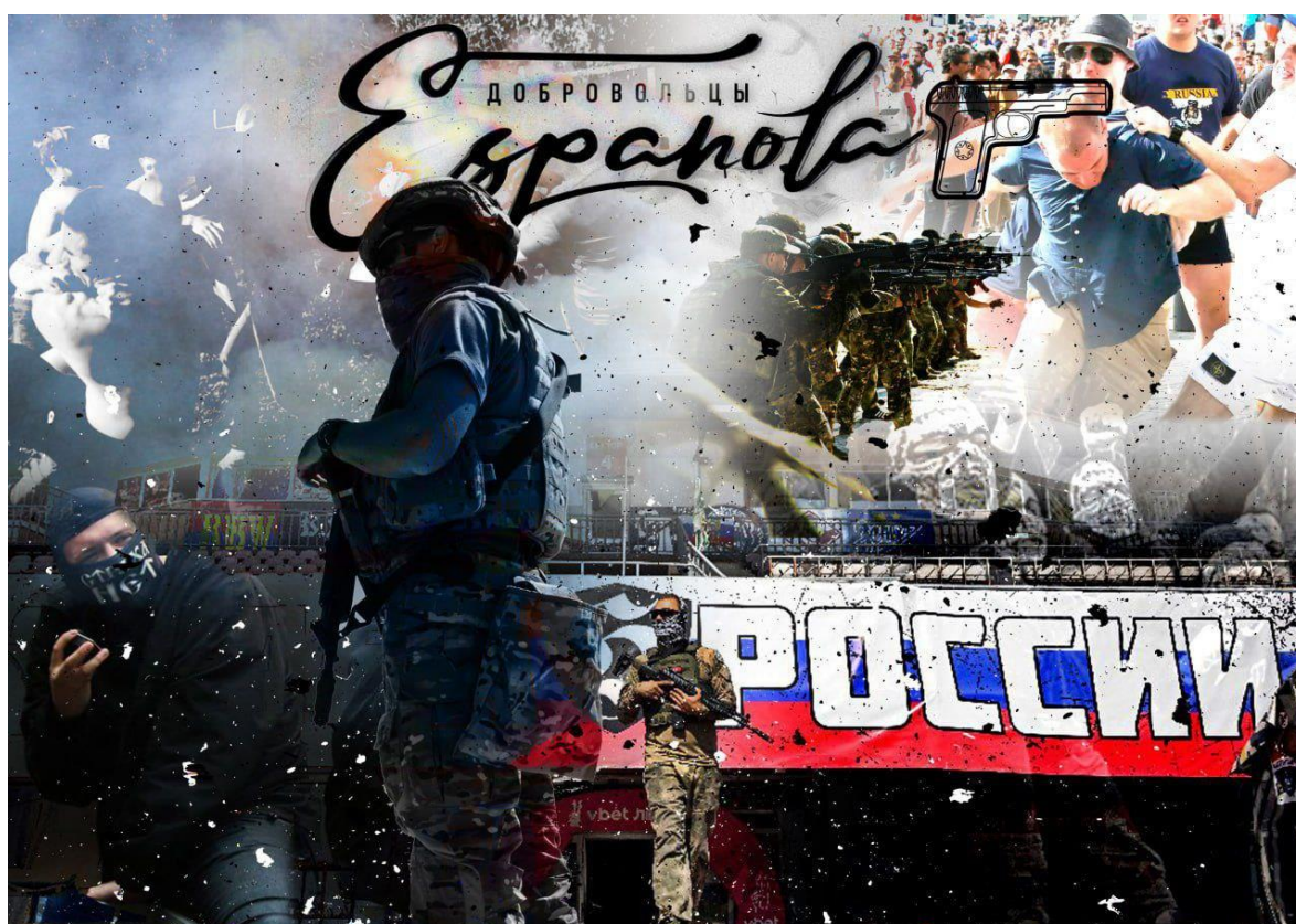
Figure 8: Espanol propaganda banner

The functioning of the network was observed in the days immediately following the Russian invasion in February 2022. Following the Russian attack, the actors organised themselves as a spontaneous infrastructure to support operations in Ukraine. The network of groups and organisations, being already well structured, became active in a short time and immediately provided support for the recruitment, propaganda, and financing of the PMC Wagner. The network of far-right, alt-right, and supremacist actors rooted over the years organised itself as a spontaneous infrastructure to support operations.