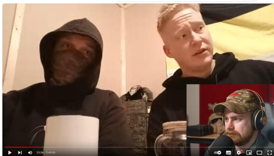
Why We Fight, Why They Marched - Exclusive Interview with Wagner PMC & Soldier, Wounded In Ukraine

The symbolism of the PMC Wagner combines various neo-Nazi elements with the classical symbols tied to Russian nationalism. On PMC Wagner profiles on Telegram and VK, the mercenaries often published their images with the Russian Imperial Movement (RIM) flag, a white supremacist paramilitary group that the US designates as a terrorist organization (figure 6) 28 . Even the symbol of Rusich, a reconnaissance, sabotage, and assault group formed in 2014, directly attached to the PMC Wagner, shows the colors of the RIM flag with the Black Sun, an icon found on the floor of Wewelsburg Castle, the ideological and spiritual center of the SS since 1934 (figure 7). The main "uniting" factors of Rusich, a multi-national group that includes Poles, Norwegians, Bulgarians, and probably Serbs, are national socialism and adherence to native European faiths. We note how the ideological spectrum depicted in the PMC Wagner symbol is at once specific but broad enough to reach different communicative targets. In this spectrum, we find Russian nationalists, anti-Ukraine, white supremacists, and accelerationists.