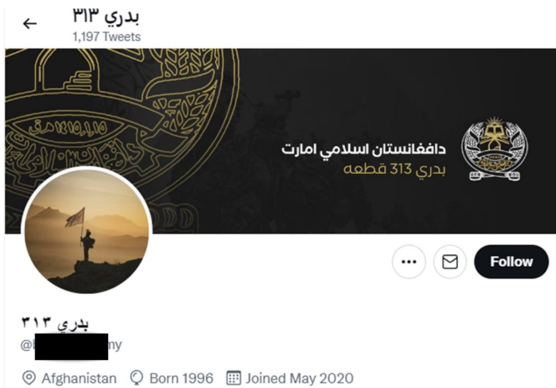
Figure 5: Twitter page Badri 313 09/2022