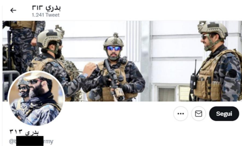
Figure 4: Twitter page Badri 313 06/2022