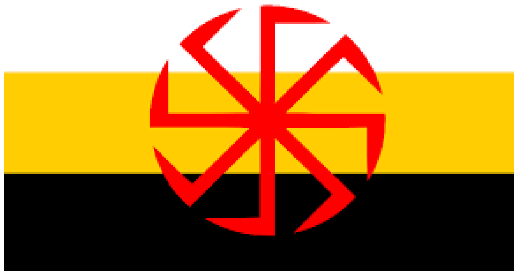
Figure 7: Rusich Symbol

The PMC Wagner has built an impressive online propaganda apparatus that has further expanded the recruitment pool by tapping into international European far-right circuits. The network of far-right and alt-right actors in Europe, especially in North and Western Europe, thanks to football communities and mixed martial arts tournaments was linked to the recruitment apparatus of the PMC Wagner. The data collection shows that the content of propaganda varied before and after the outbreak of hostilities. Football ultras and drills in rooms adorned with neo-Nazi symbols during wartime were added to war bulletins, video messages from commanders, bank details, and crypto wallets for funding. Finally, the affirmation of a media house formed by PMC Wagner veterans, deployed also in Africa and the Middle East, was observed.