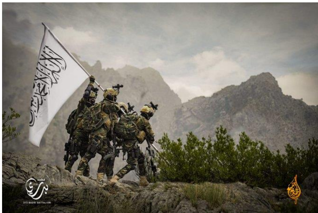
Figure 1: Photo taken from the “Graduation Day”

features a photograph depicting Taliban soldiers in the act of hoisting the flag of the Afghan emirate, recalling the US seizure of Mount Suribachi on Iwo Jima in 1945 (figure 1).