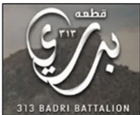
Figure 2: first official logo of Badri 313

313. The account's profile picture itself no longer showed a militiaman in camouflage with a covered face, but in June 2022 it shows well-equipped, and smiling soldiers can be seen as if they wanted to convey a sense of security and serenity (figure 4). Finally, the profile photo and banner were changed again and those now show a soldier with the Taliban Flag and the official symbols of the Taliban Emirate (figure 5).